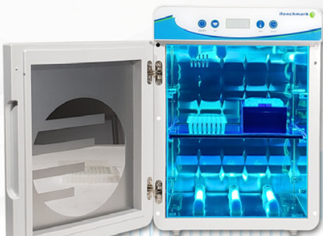
6-bulb design with UV-C transparent shelf for 360° exposure